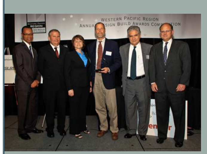
Merit Award Golden West College Rehabilitation/Renovation/Restore Southland Industries