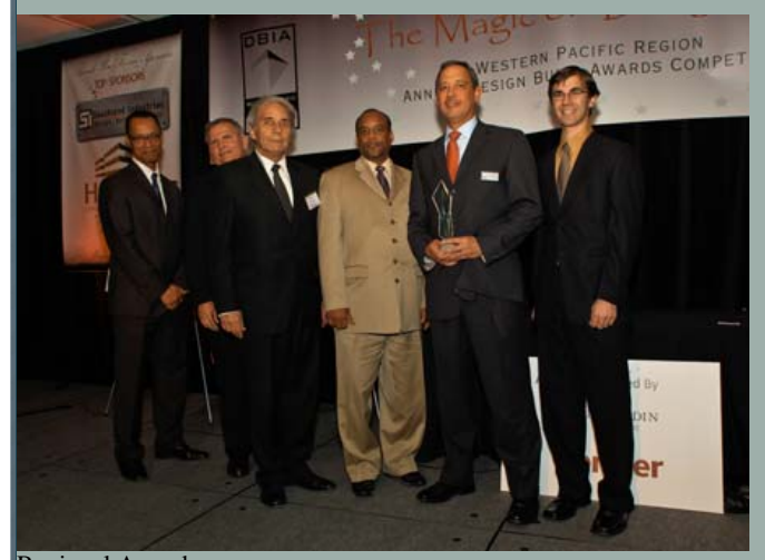
Regional Award Richmond Civic Center Revitalization Rehabilitation/Renovation/Restore Charles Pankow Builders