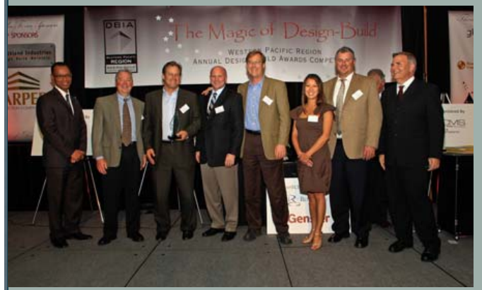
Excellence Award Chabot- Las Positas Community College District Rehabilitation/Renovation/Restore Southland Industries

Bachelor Enlisted Quarters P-991 and Learning Resource Center Public under $15 million Harper Construction/C.S.C. & Associates