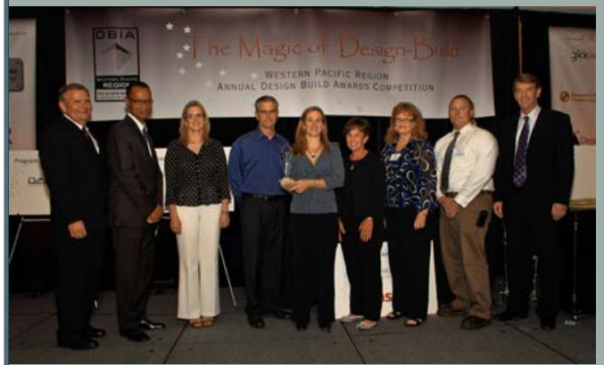
Regional Award Moonlight Amphitheatre Public Under $15 million Sundt Construction