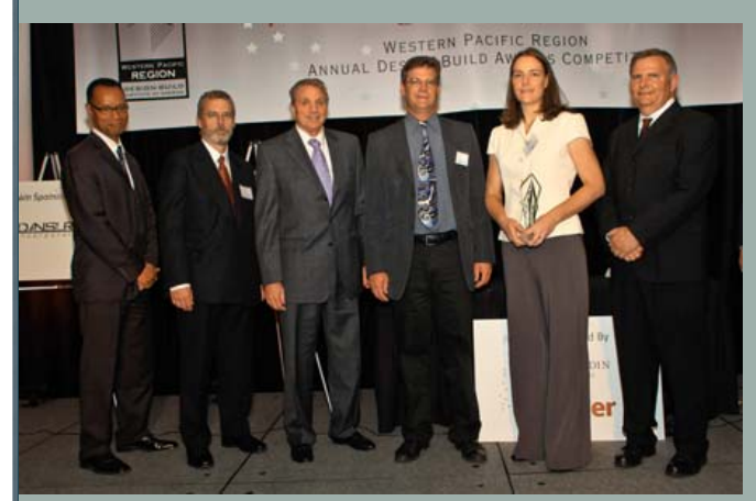
Regional Award San Joaquin County Administration Building Public over $15 million Hensel Phelps Construction Company