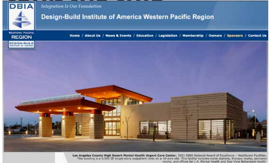
Los Angeles County High Desert Mental Health Urgent Care Center; 2021 DBIA National Award of Excellence – Healthcare Facilities. This building is a 9,900 SF single-story outpatient clinic on a 16-acre site. This facility includes nurse stations, therapy rooms, seclusion rooms, and offices for L.A. Mental Health and Scar View Behavioral Health.

DBIA-WPR 2025 Website Sponsorship Opportunity!