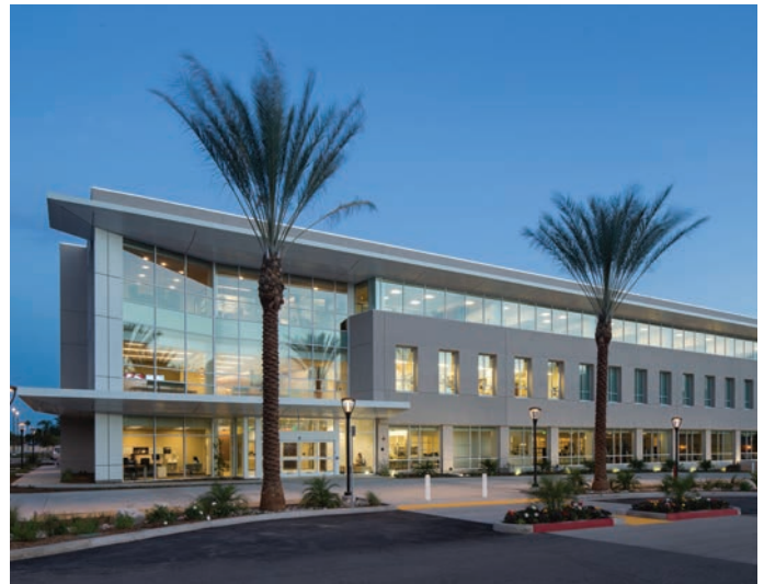
Robert & Beverly Lewis Outpatient Pavilion ▲

Also submit your project in the National Awards Competition. Remember: Western Pacific Region requirements are similar to the National Awards Program, but have significant variation in requirements. Refer to www.DBIA.org for information regarding the National Competition.