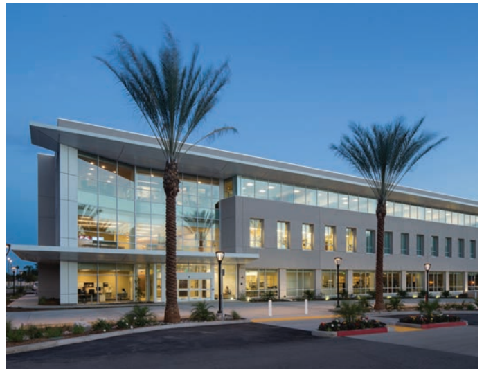
Robert & Beverly Lewis Outpatient Pavilion ▲

Also submit your project in the National Awards Competition. Remember: Western Pacific Region requirements are similar to the National Awards Program, but have significant variation in requirements. Refer to www.DBIA.org for information regarding the National Competition.