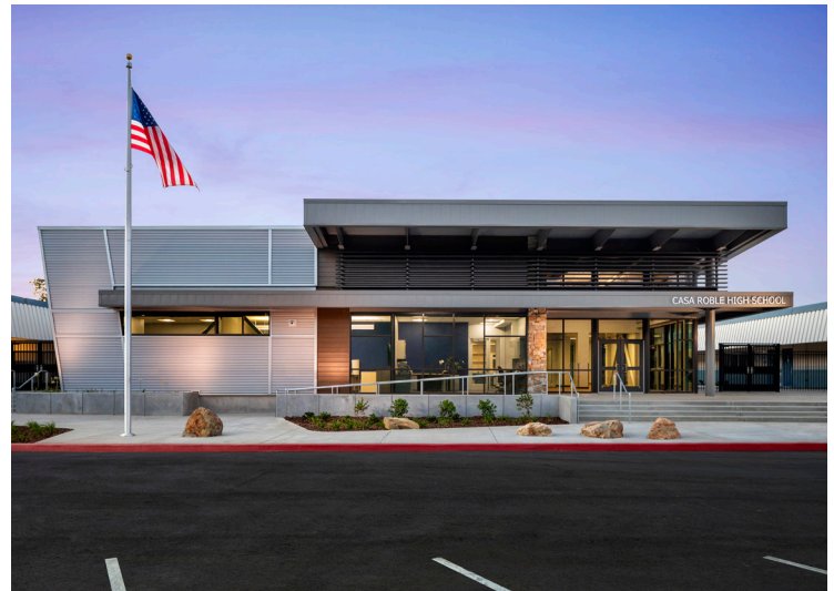
Casa Roble High School Student Union & Admin Building ▲

Also submit your project in the National Awards Competition. Remember: Western Pacific Region requirements are similar to the National Awards Program, but have significant variation in requirements. Refer to www.DBIA.org for information regarding the National Competition.