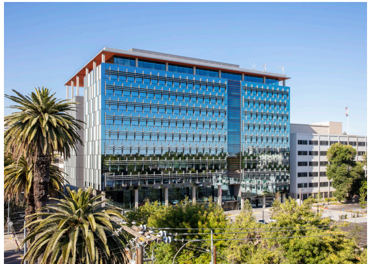
Clifford L. Allenby State Office Building ▲

Also submit your project in the National Awards Competition. Remember: Western Pacific Region requirements are similar to the National Awards Program, but have significant variation in requirements. Refer to www.DBIA.org for information regarding the National Competition.