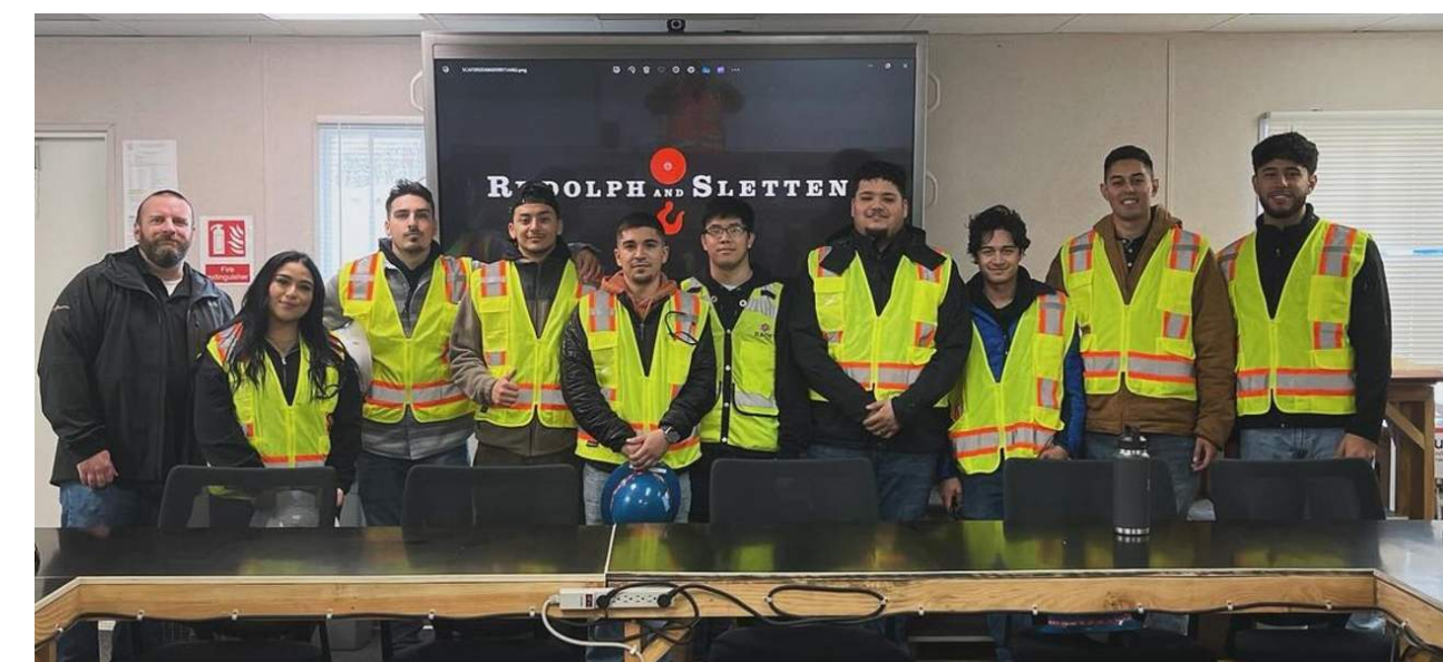
STEAM Building , Rudolph and Sletten Inc.