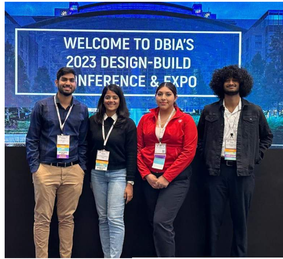
DBIA National Conference

Our chapter's highlight was attending the DBIA National Conference.