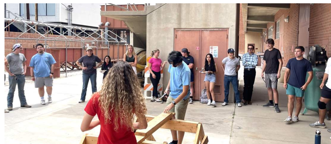
DBIA UA Chapter meeting, end of semester Nail Driving Contest