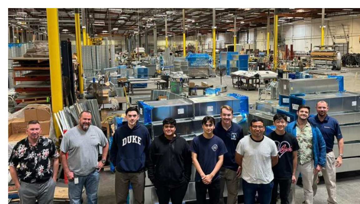
Southland September 29th Site Tour