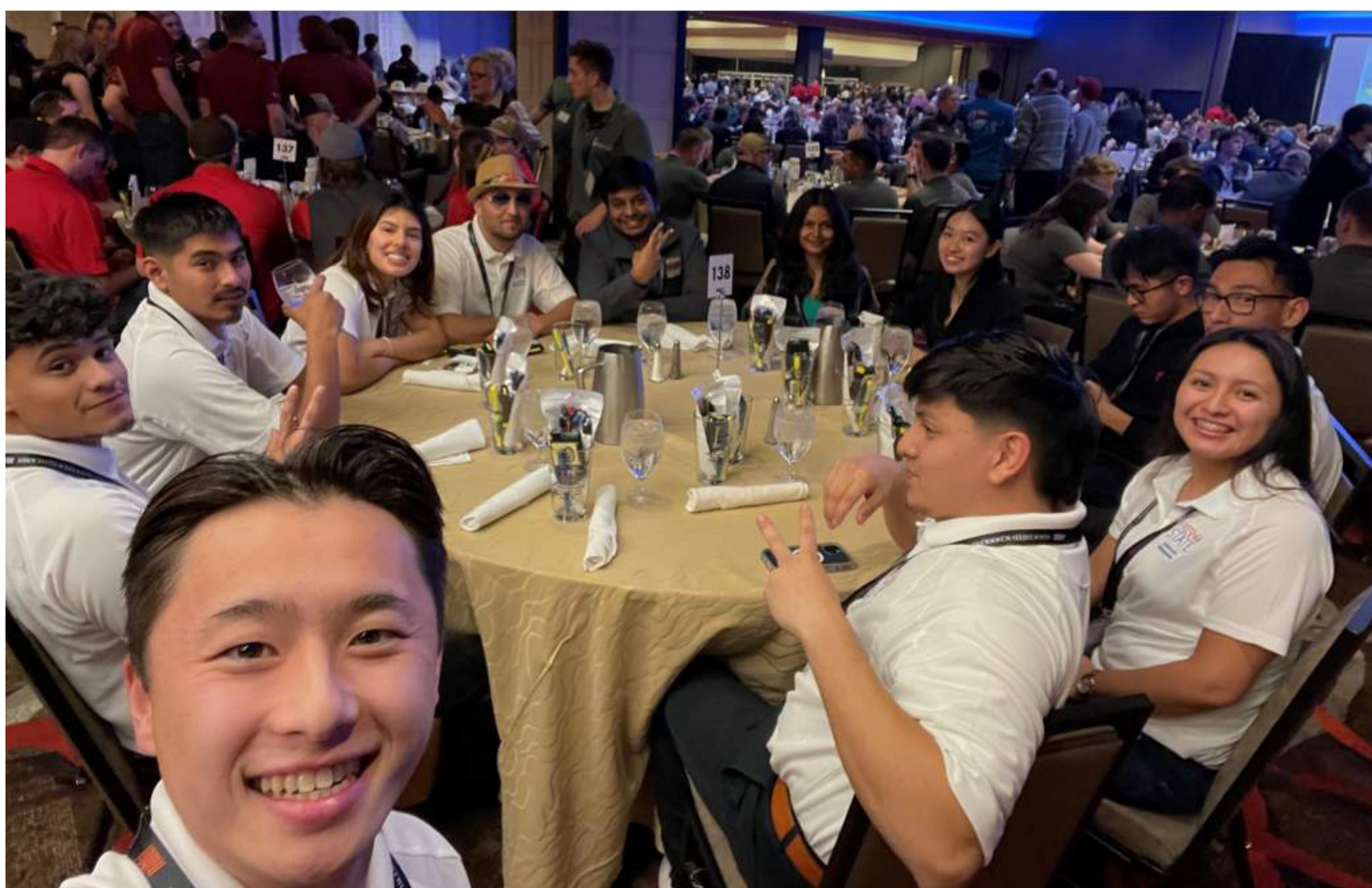
ASC Competition Dinner

We competed in the ASC Regions 6 & 7 Student Competitions and placed 3rd for Region 6! Excited to try again next year!