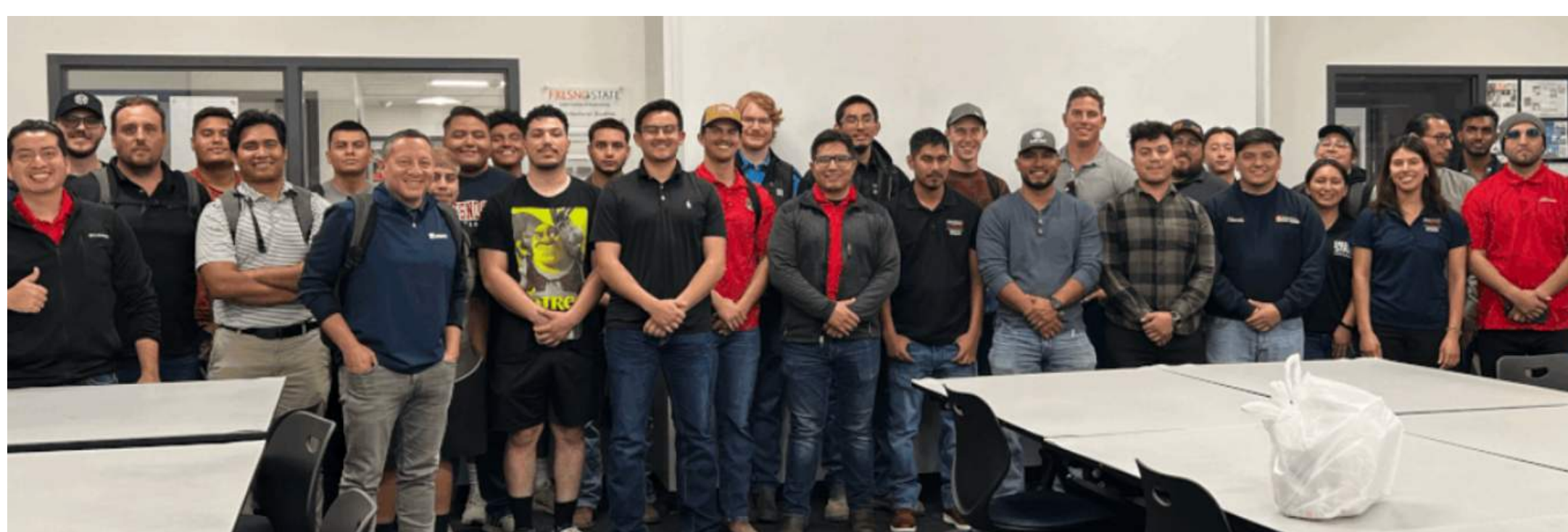
Mock Presentation with Quiring General & Swinerton