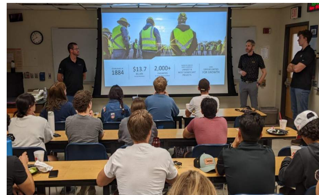
Chapter meeting with Kiewit