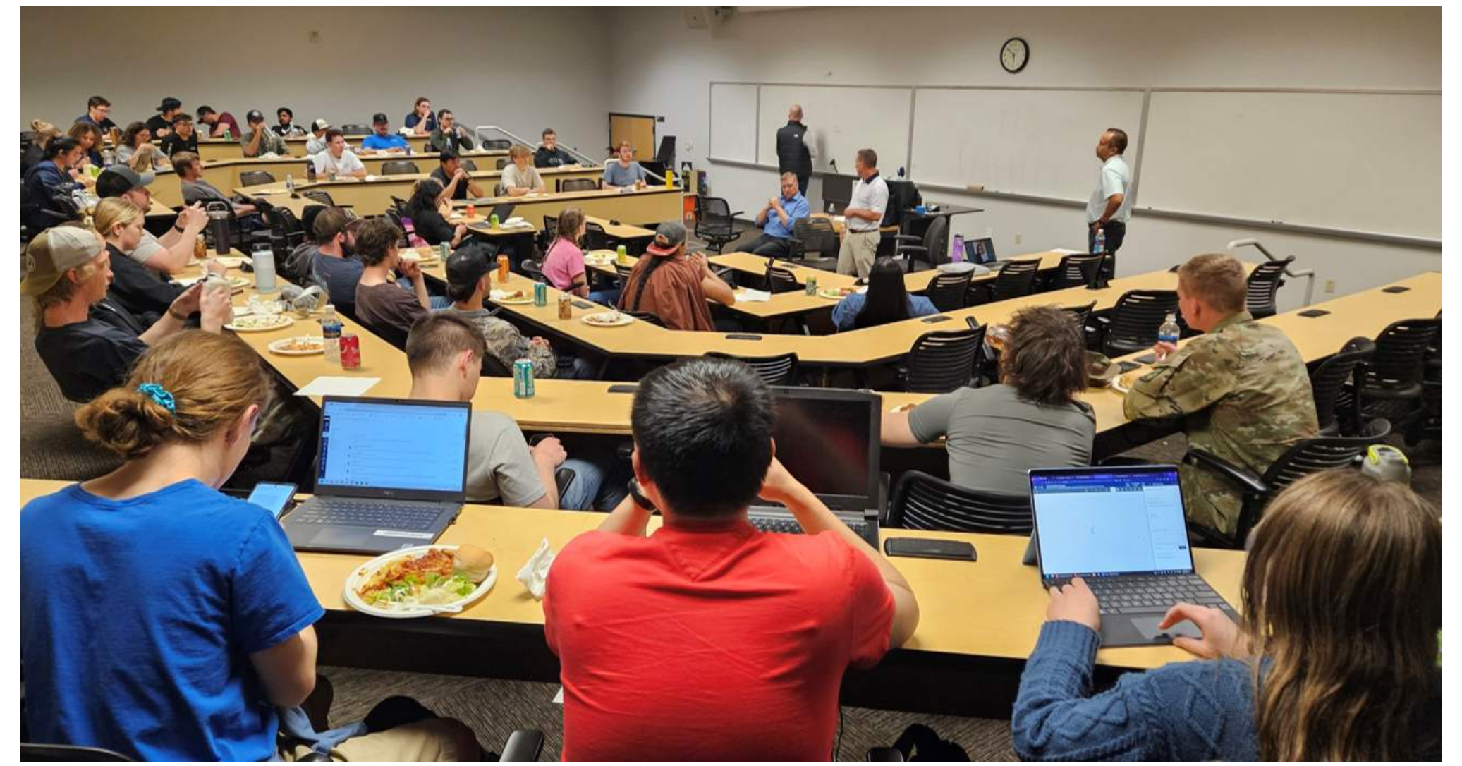
45 Chapter Members

Our chapter highlight was having our members compete in ASC and DBIA competition for the first time.