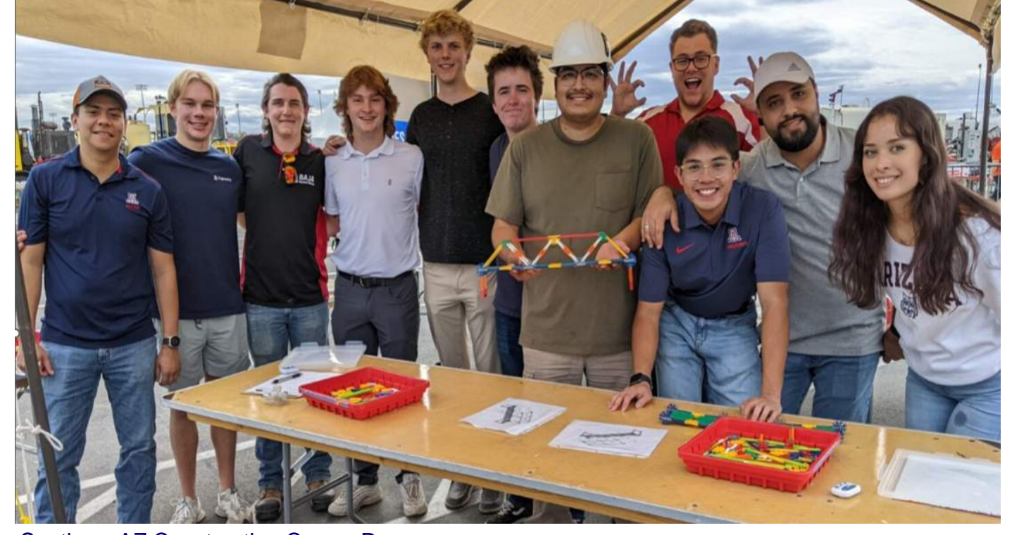
Southern AZ Construction Career Days