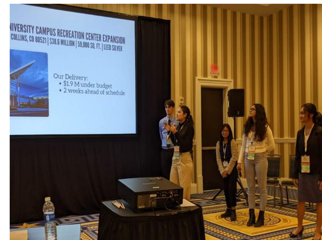
U of A Team presenting @ DBIA National Student Competition and earning 3rd place