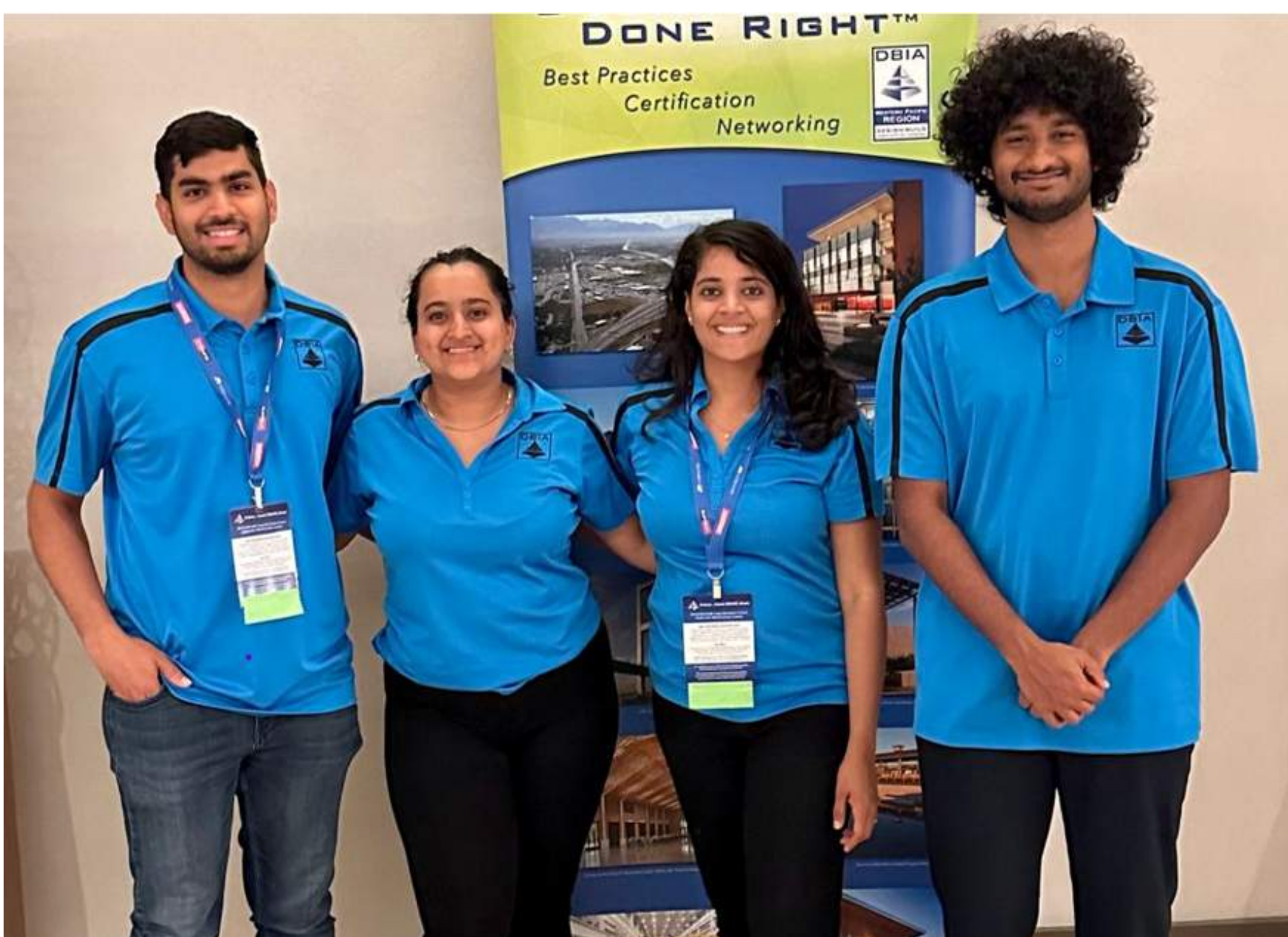
DBIA Regional Conference