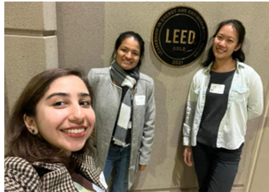
DBIA WPR Holiday Party