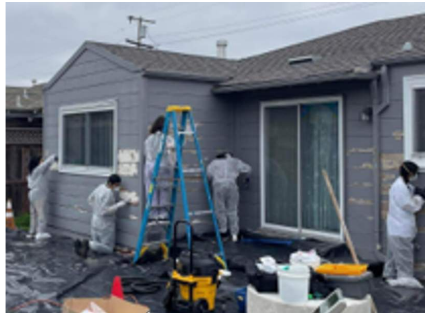
Volunteered with Rebuilding Together + LBE Philanthropy Chair