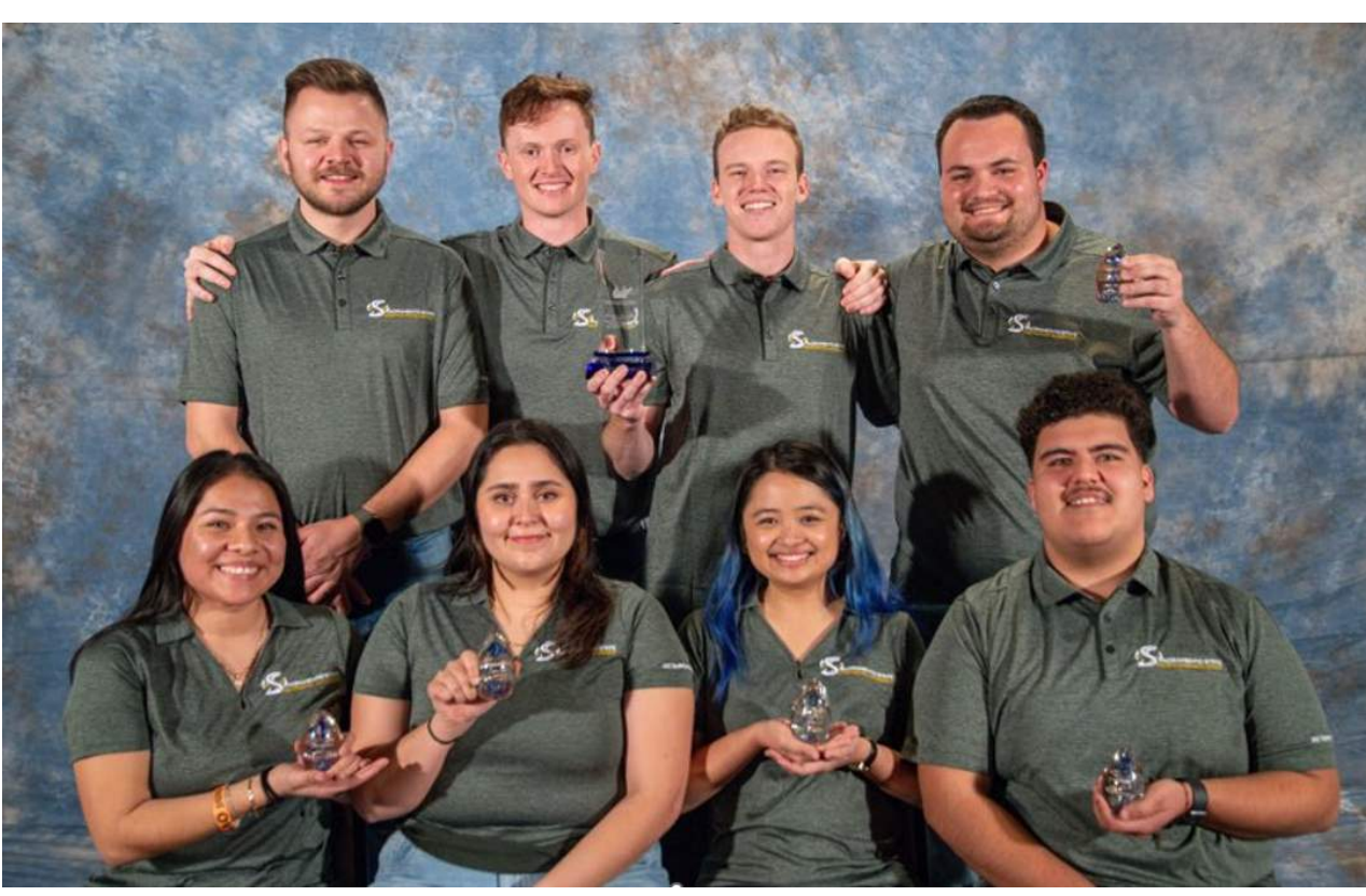
2nd Place ASC Design Build Reno Team