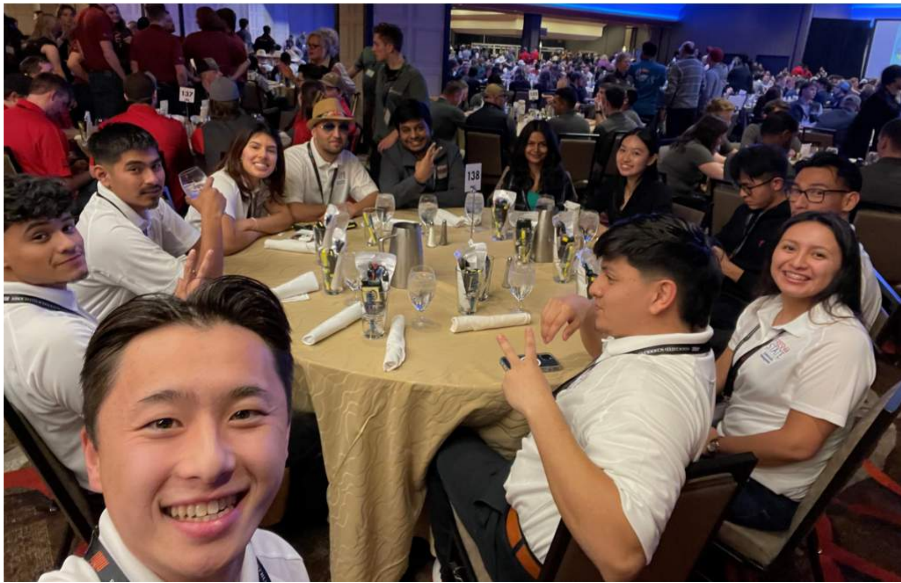
ASC Competition Dinner

We competed in the ASC Regions 6 & 7 Student Competitions and placed 3rd for Region 6! Excited to try again next year!