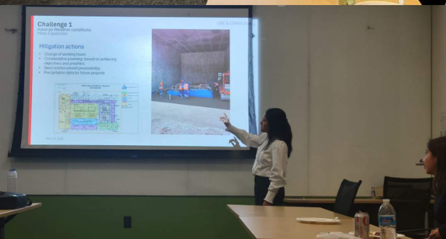
Student-led construction experience sharing | CMAA + Kleinfelder