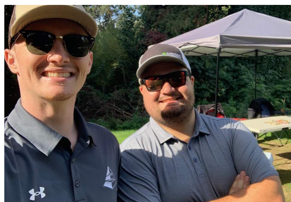
CMSA Golf Tournament Booth