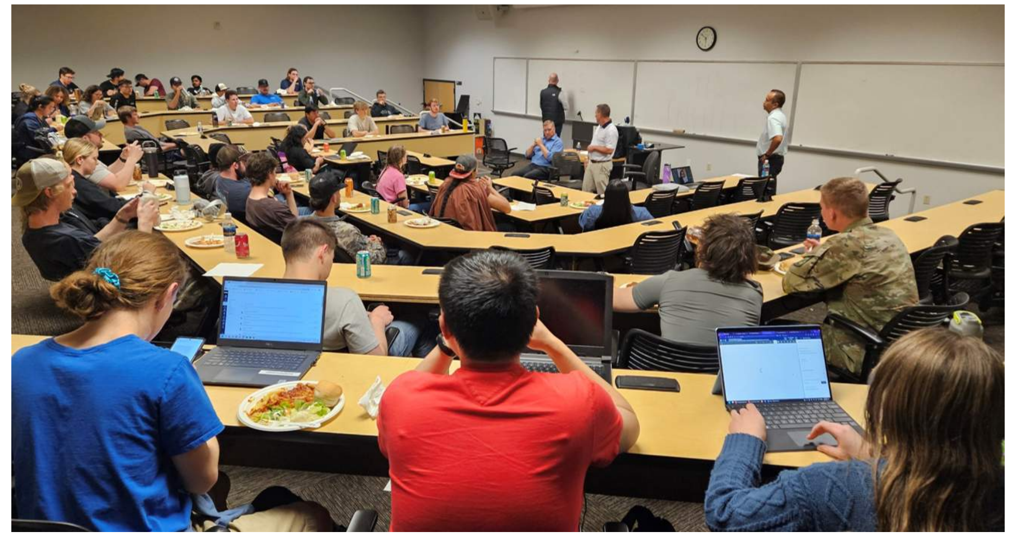
45 Chapter Members

Our chapter highlight was having our members compete in ASC and DBIA competition for the first time.