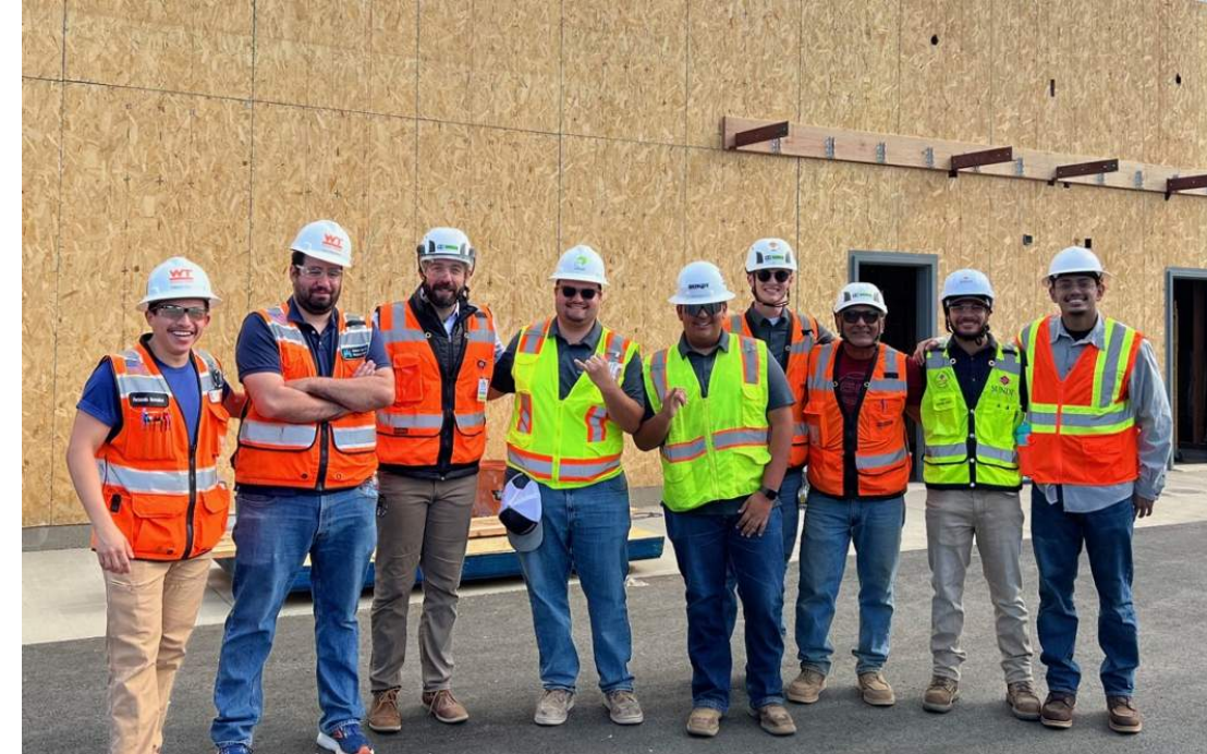
S+B James Site Walk