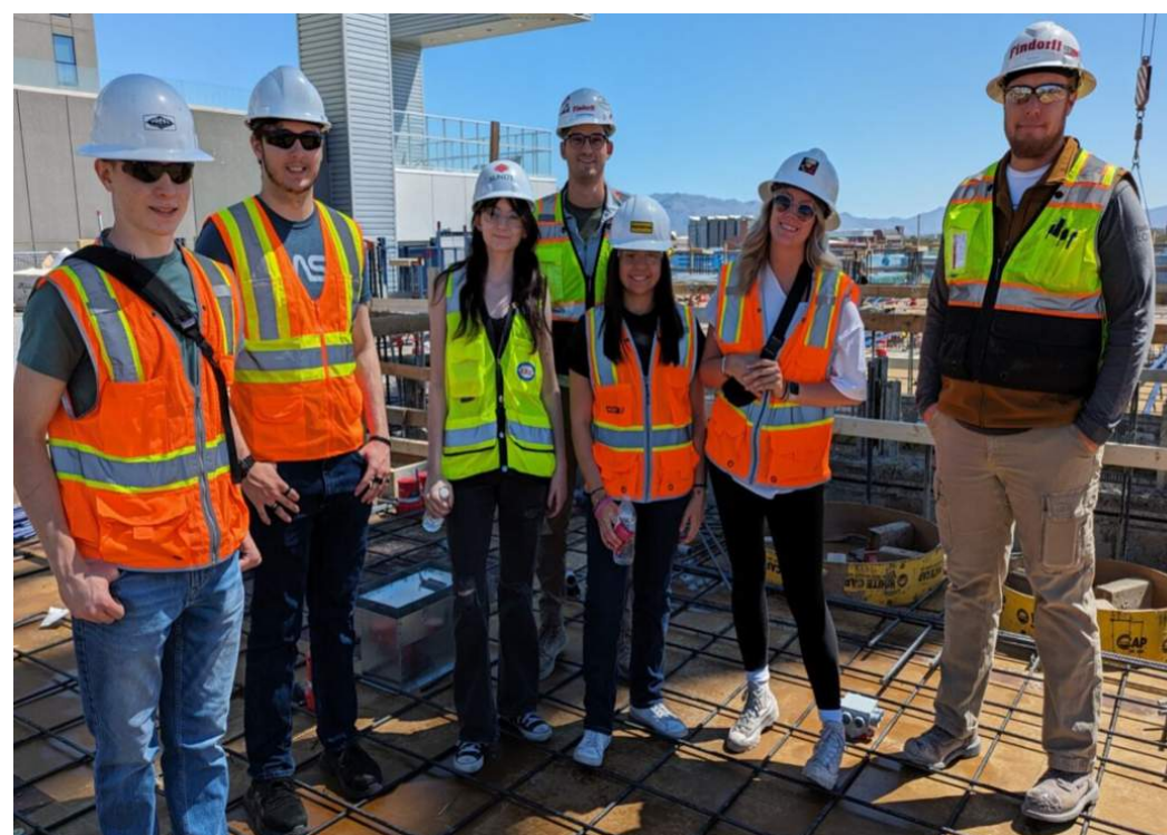
UA DBIA hosting high school students on campus for college and career day