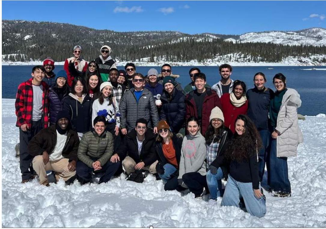
Chapter retreat at Shaver Lake