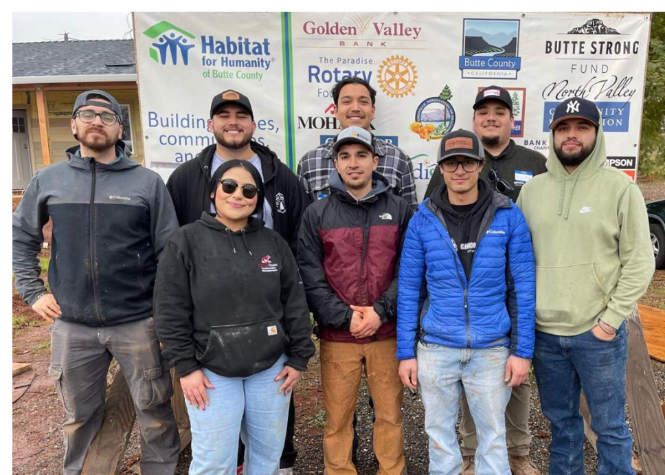
Habitat for Humanity, Paradise