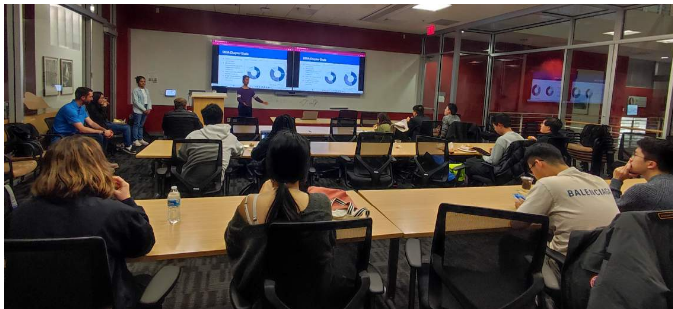
Kickoff meeting DBIA Stanford Chapter | Hensel Phelps