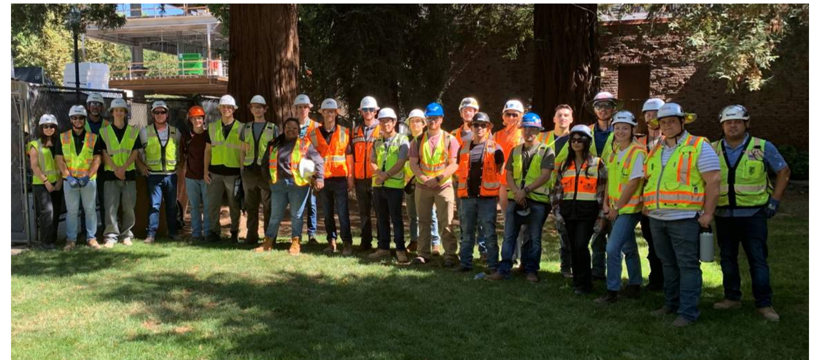
Chico State BSS, Turner Construction