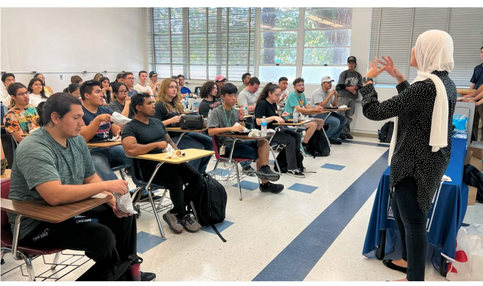
Lane Construction Sept 12th Lunch and Learn