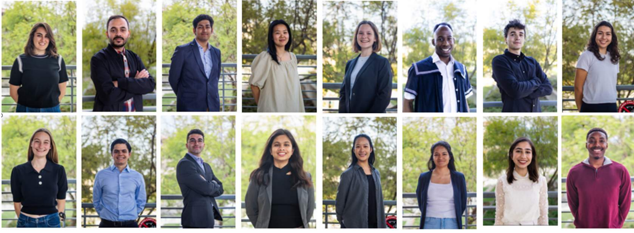
68 Chapter Members