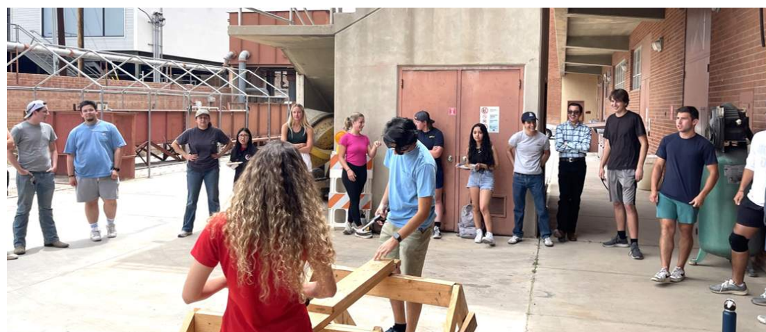
DBIA UA Chapter meeting, end of semester Nail Driving Contest