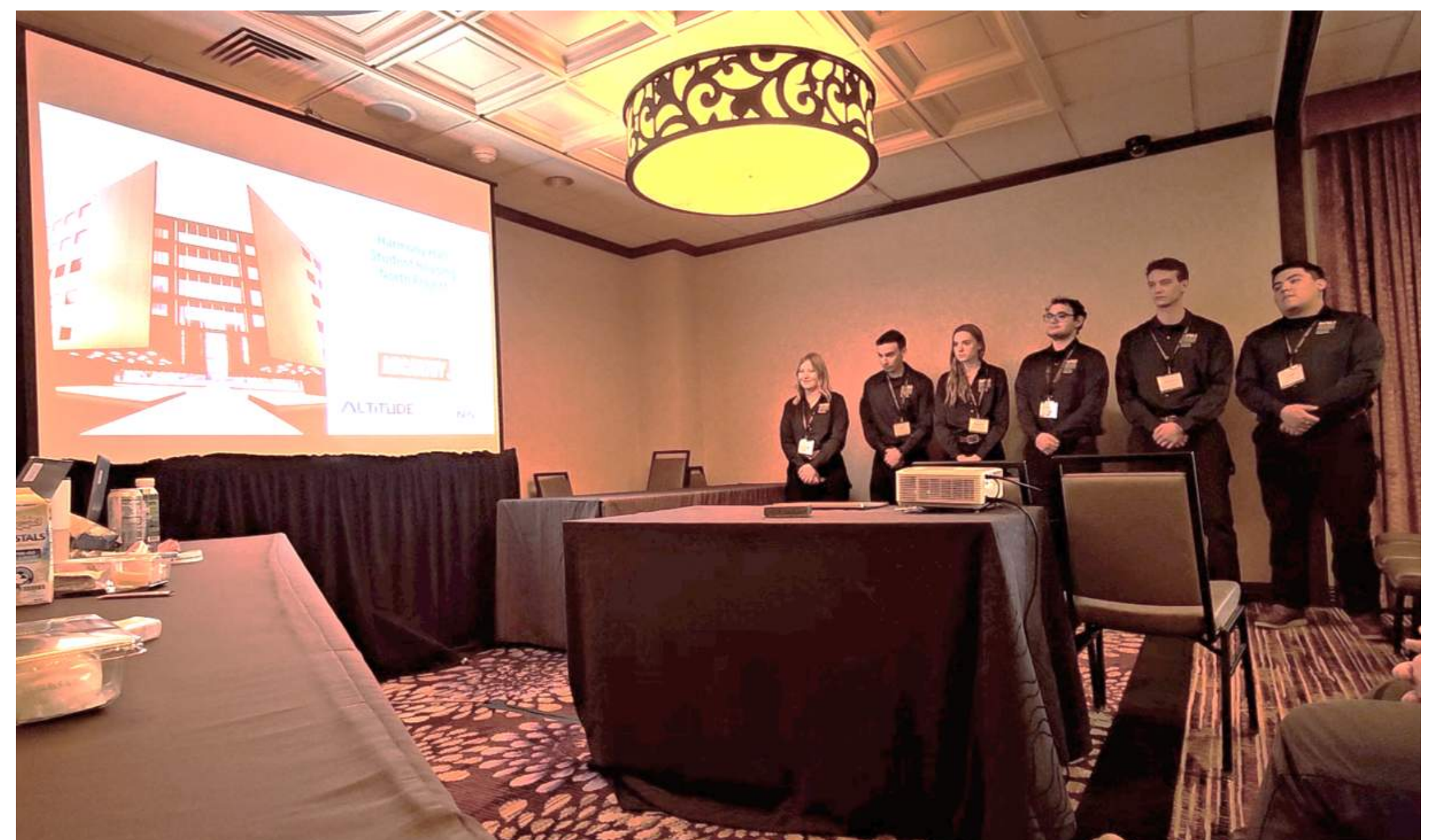
ASC Design Build Region 6 Competition Industry Mentors: Holder Construction, Ryan Companies, & WMA Architects