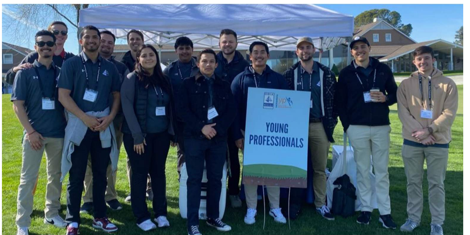
30+ Chapter Members