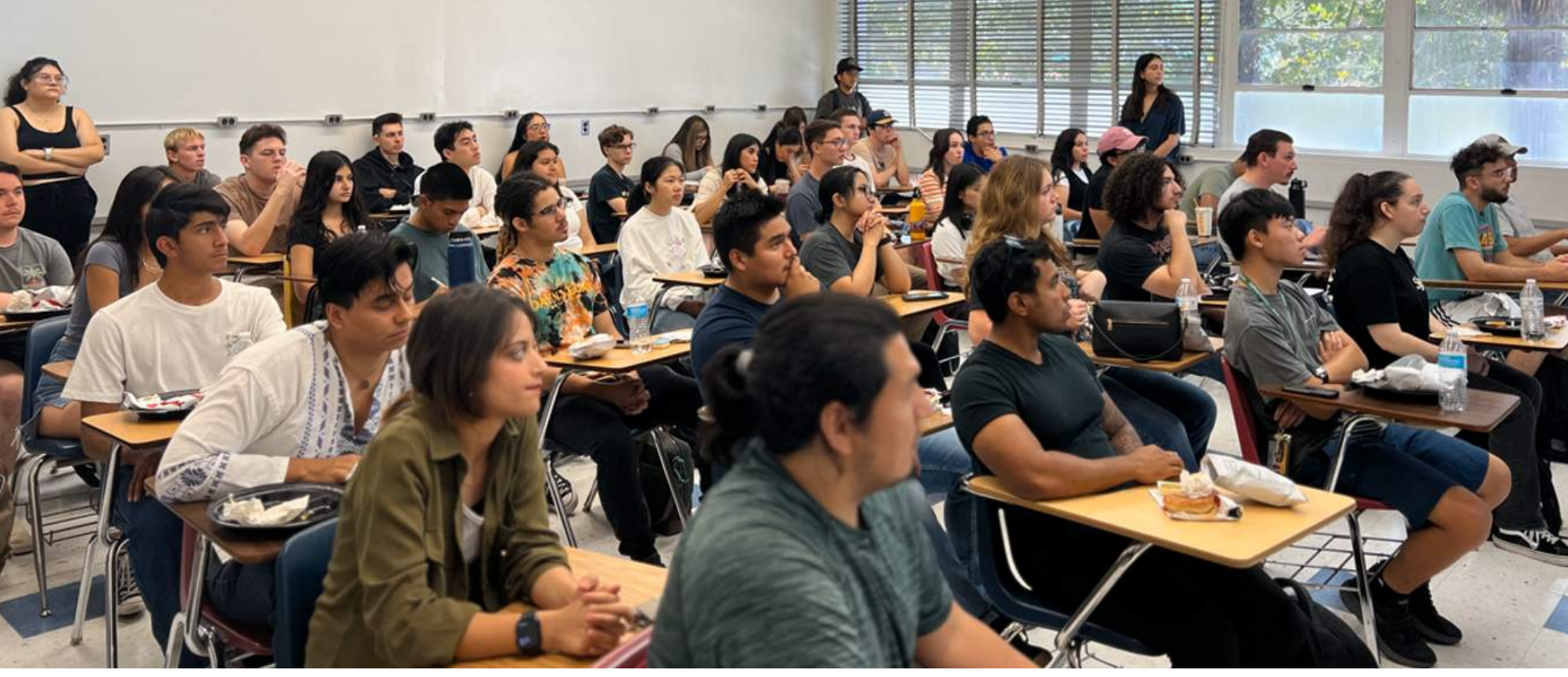
30 Chapter Members