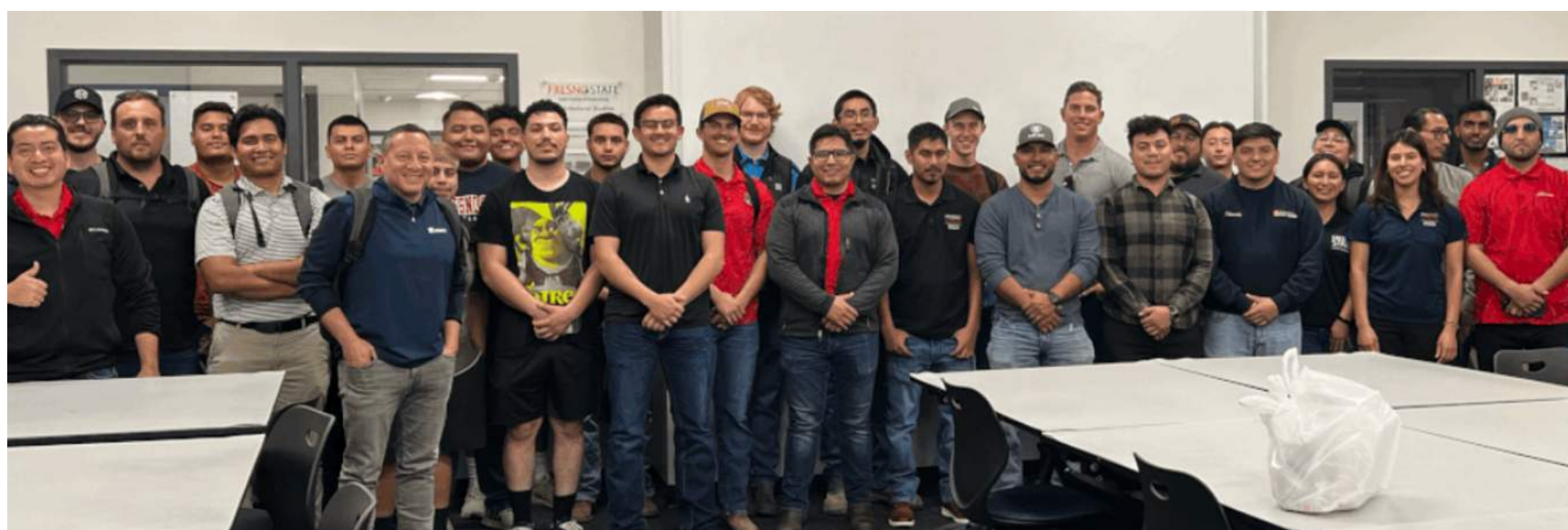
Mock Presentation with Quiring General & Swinerton