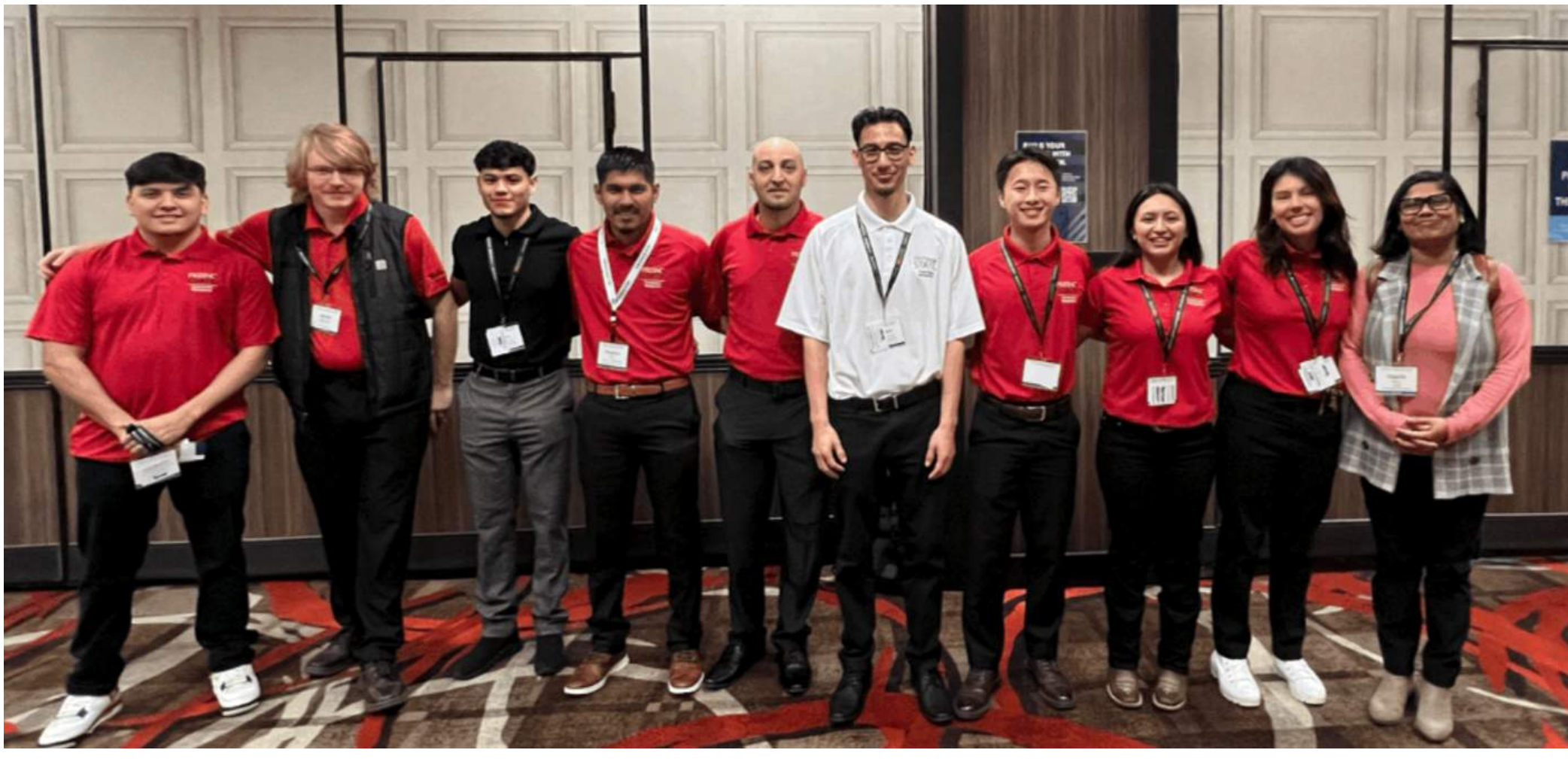
14 Chapter Members