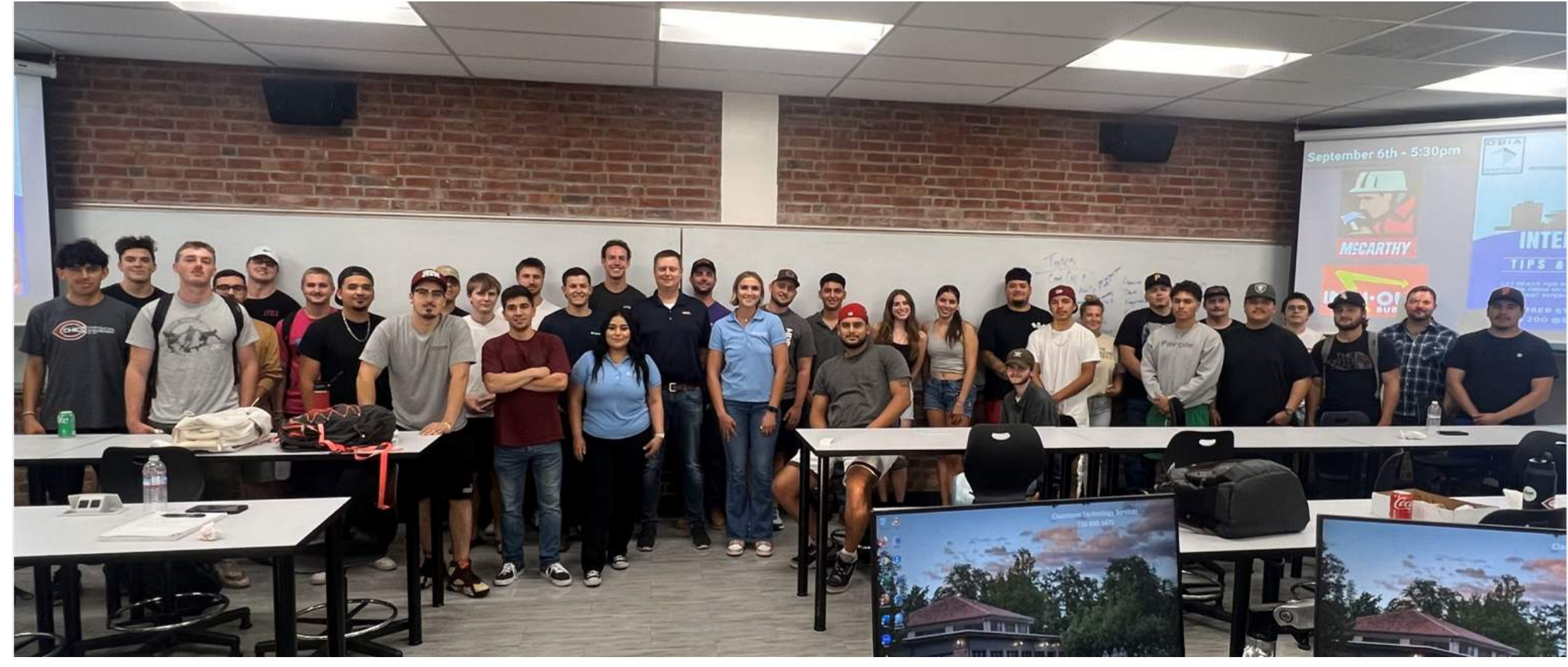
76 Chapter Members