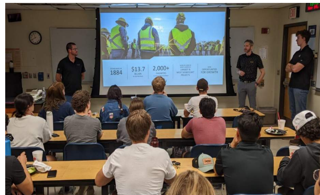
Chapter meeting with Kiewit