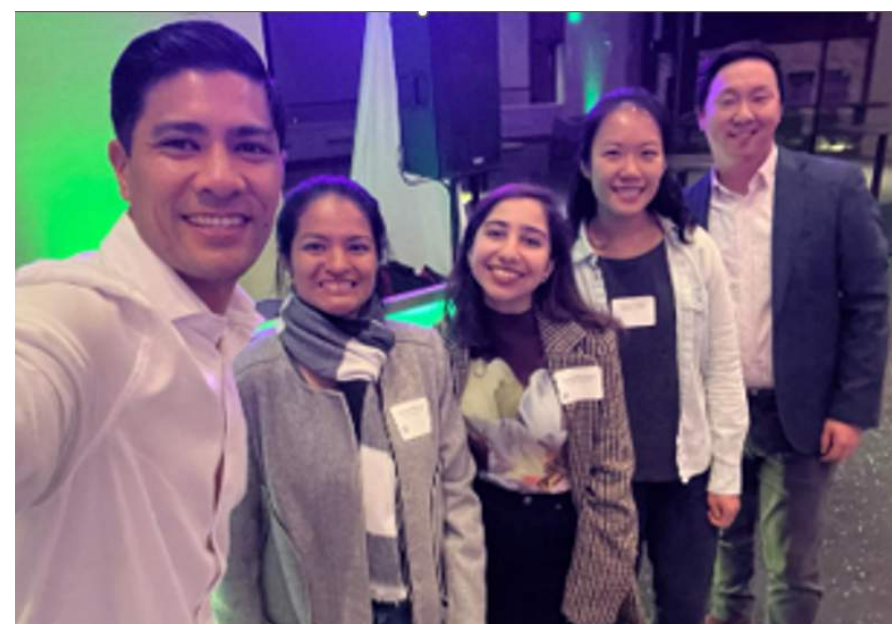
DBIA WPR Holiday Party