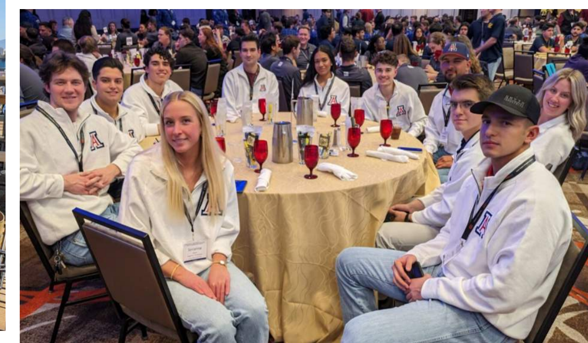
U of A Competition teams at ASC Regional Region 6 & 7