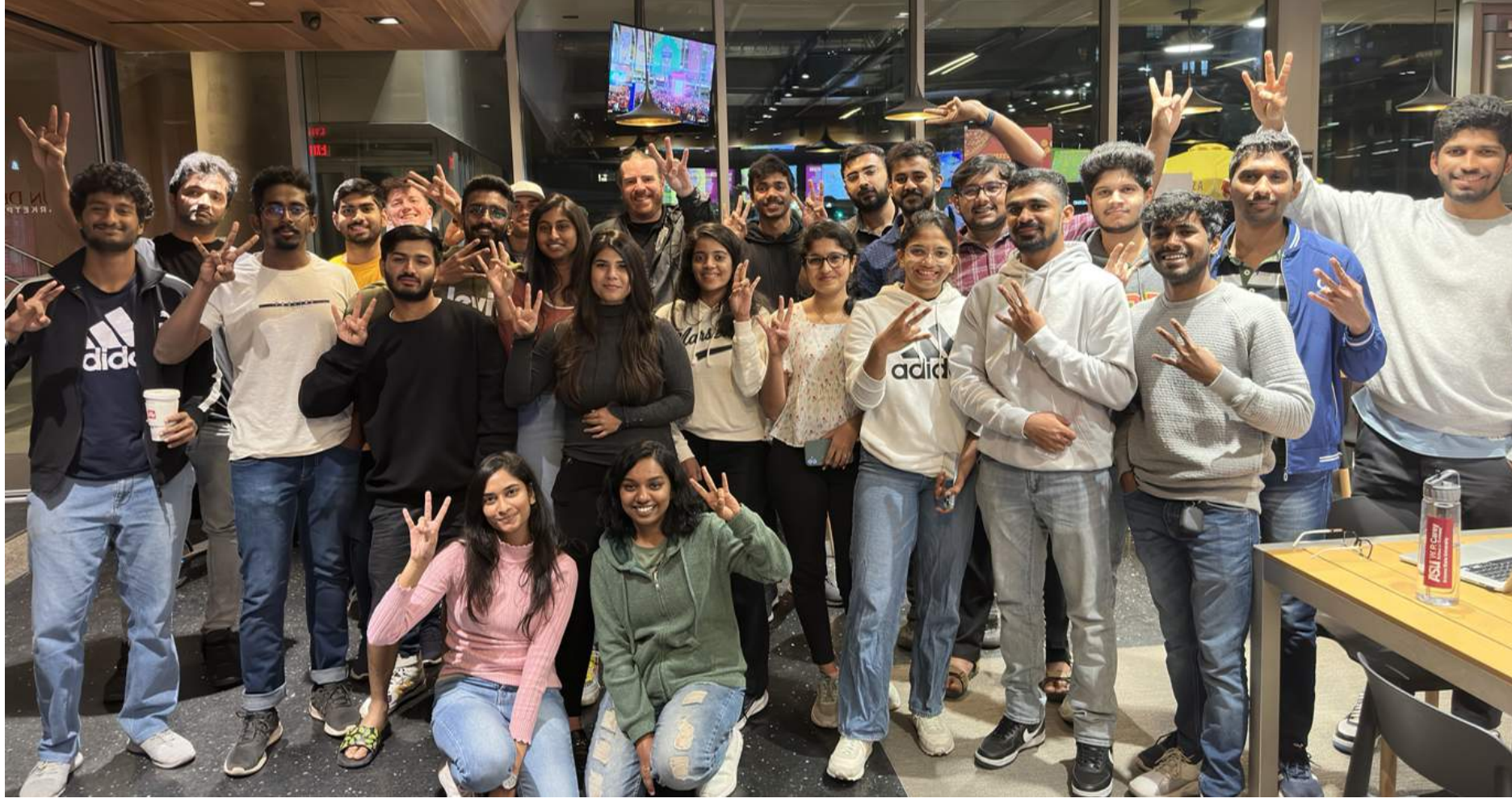
76 Chapter Members