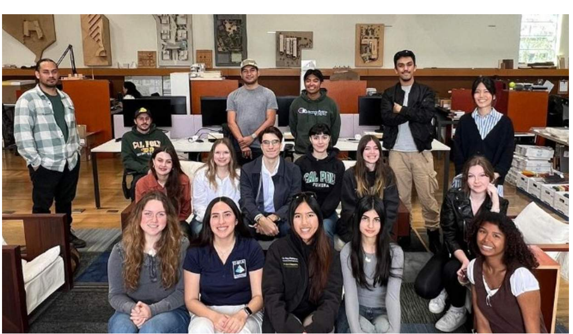
EYRC March 13th Firm Tour