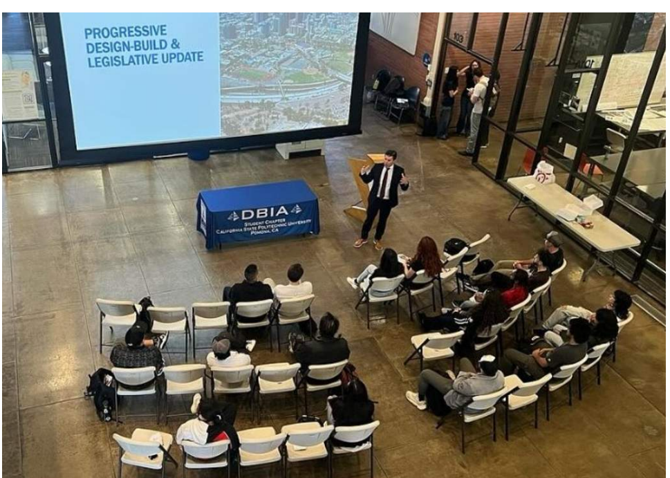
Cannon Design April 9th Lunch and Learn