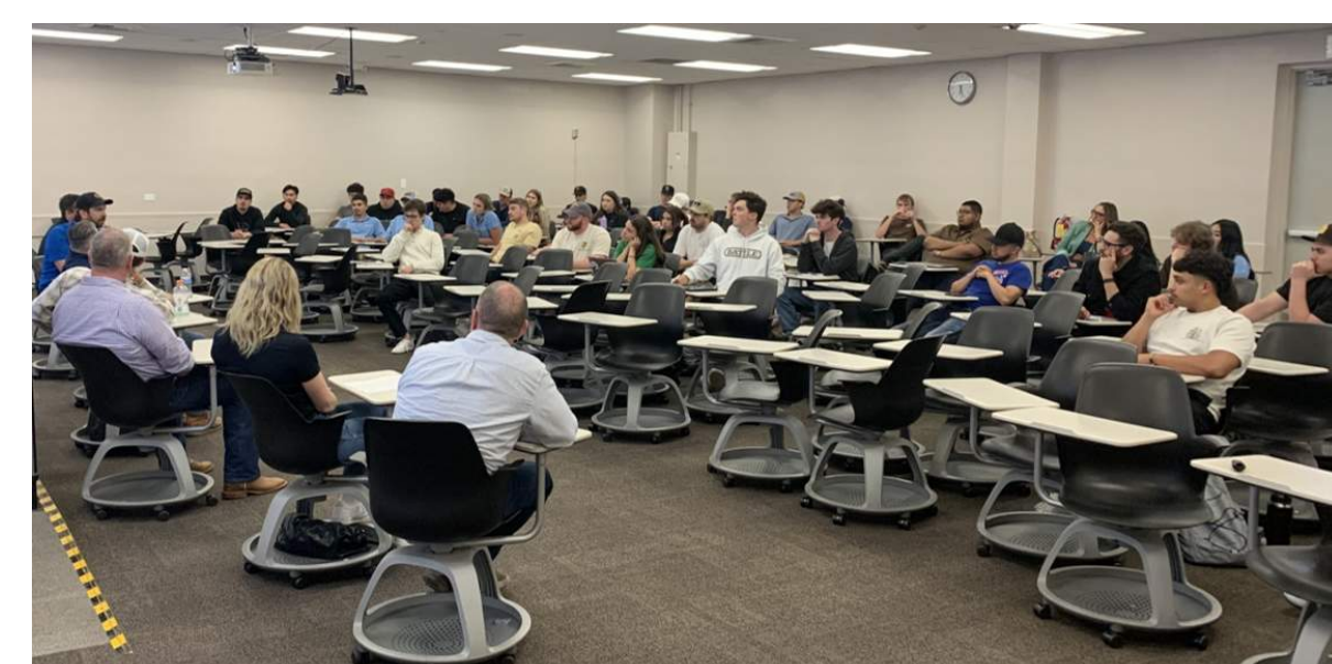
Industry Panel Night, R&S, KDW, Swinerton, Turner