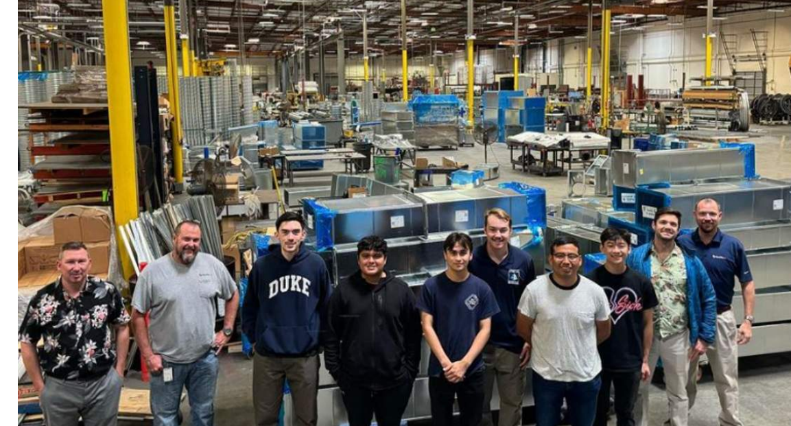
Southland September 29th Site Tour