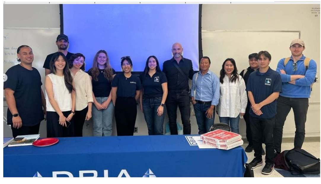
EYRC November 21st Lunch and Learn