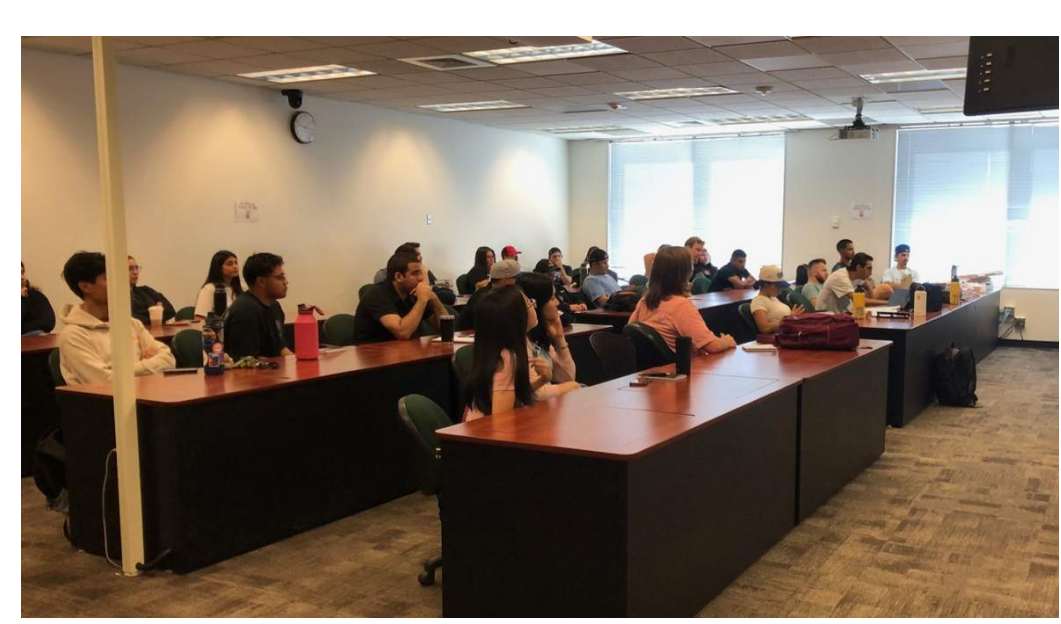
Swinerton Lunch & Learn