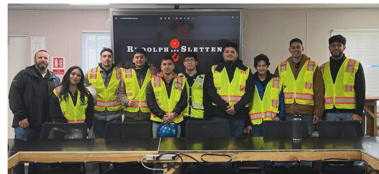
STEAM Building, Rudolph and Sletten Inc.