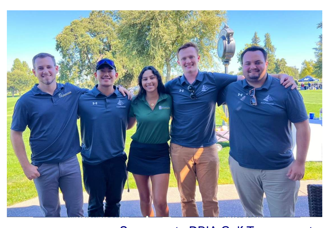
Sacramento DBIA Golf Tournament