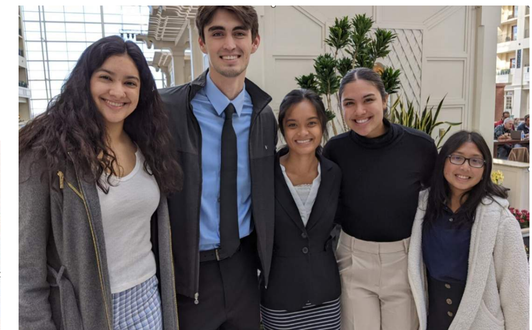
U of A team at DBIA National Conference