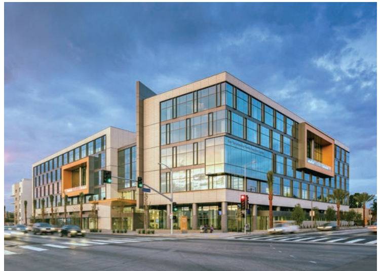
Zev Yaroslavsky Family Support Center ▲

Also submit your project in the National Awards Competition. Remember: Western Pacific Region requirements are similar to the National Awards Program, but have significant variation in requirements. Refer to www.DBIA.org for information regarding the National Competition.