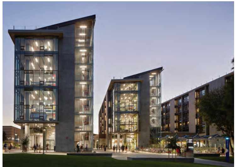
UCI Mesa Court Student Housing Expansion ▲

Also submit your project in the National Awards Competition. Remember: Western Pacific Region requirements are similar to the National Awards Program, but have significant variation in requirements. Refer to www.DBIA.org for information regarding the National Competition.